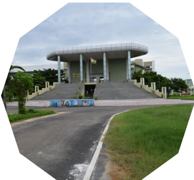
Dr. MGR FCRI - Ponneri