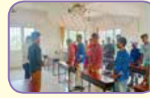
PPIFT, Madhavaram, Chennai