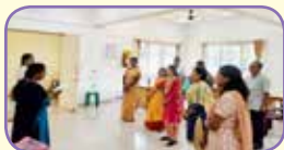
College of Fish Nutrition & Food Technology, Madhavaram