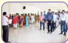
Dr.MGR Fisheries College & Research Institute, Thalainayeru