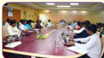
Dr.MGR FCRI, Ponneri