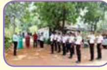
College of Fisheries Nautical Technology, Thoothukudi