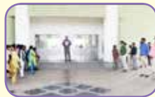
Dr.MGR Fisheries College & Research Institute, Ponneri