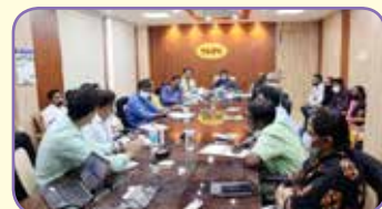
IFPGS, OMR, Vaniyanchavadi