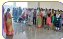
College of Fisheries Engineering, Nagapattinam