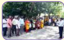
Fisheries College & Research Institute, Thoothukudi